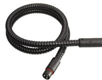
PlugIn extension cables