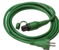
MiniPlug connection cable