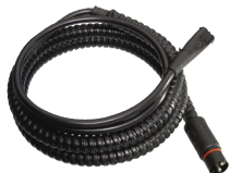
Termini™ extension cable