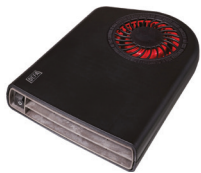
Termini™ II 1400