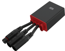
MultiCharger 1205R Flex