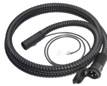
PlugIn inlet cable