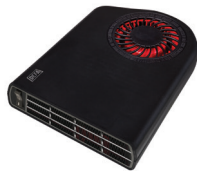
Termini™ II 1900