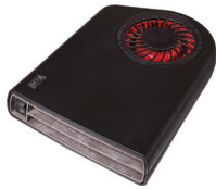
Termini™ II 1400