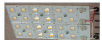
Changable LED modul.