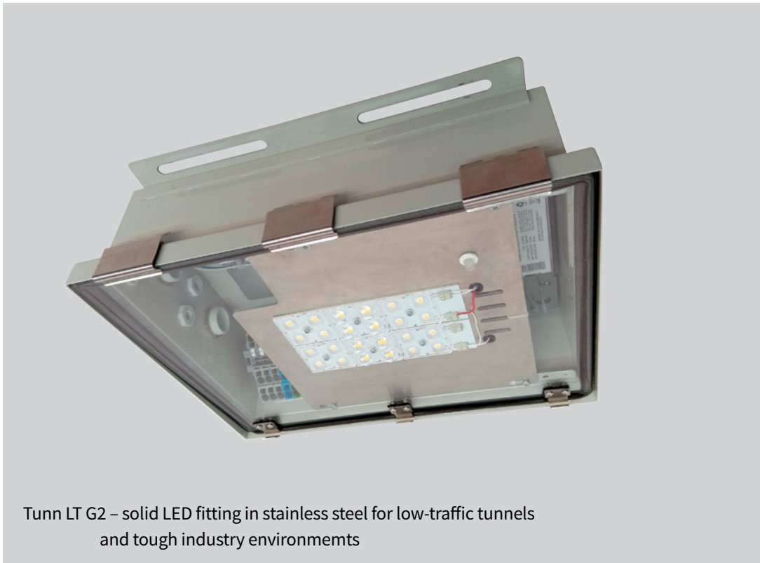
Tunn LT G2 – solid LED fitting in stainless steel for low-traffic tunnels and tough industry environments