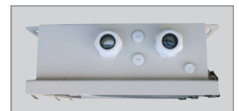
Low building height.

The fitting is as standard supplied with DALI/ StepDim, but can also be adapted different other control systems.