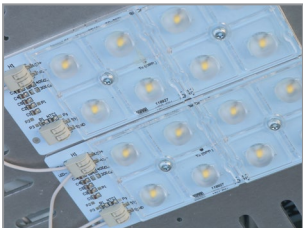
Changeable LED module