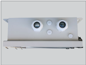
Low building height

The fitting is supplied with DALI LED-driver a standard, but can also be adapted to most others control systems and equipt with chassis contact for quick connection.