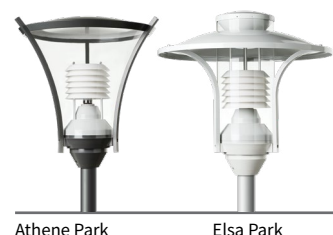
Athene Park Elsa Park