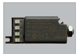
10kV Surge Protection Device with LED indicator