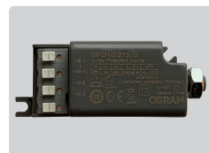
10kV Surge Protection Device with LED indicator

128901 10kV Surge Protection Device with LED indicator 119012 Wall bracket - Ø48x200 mm - 10°