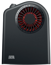
Termini™ II | 1200