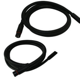
PlugIn extension cables