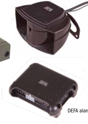
DEFA alarm system with siren, LED, sensors and window module