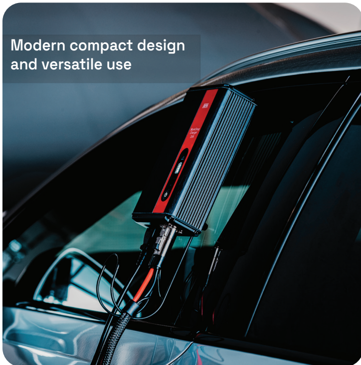
Modern compact design and versatile use