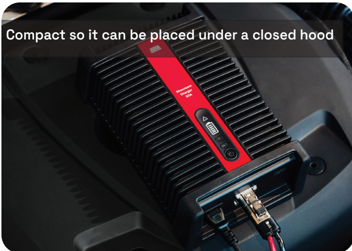
Compact so it can be placed under a closed hood