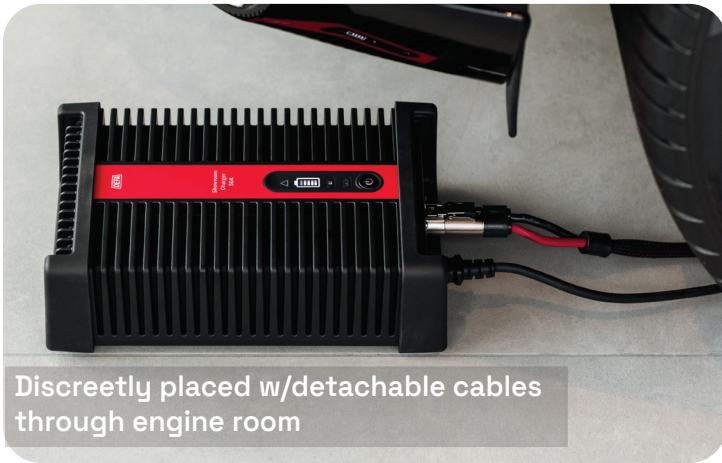
Discreetly placed w/detachable cables through engine room

High efficiency (95%+) and Power Supply mode offers a continuous and reliable current level up to 40A in 120V and 50A in 230V inputs. This is good for the environment avoiding long idling time in the cold or hot parking lot before any test drive. Thanks to its design, you can safely use the charger outdoors to maintain and charge the battery before bringing the vehicle in the workshop for its pre-delivery inspection and provisioning.