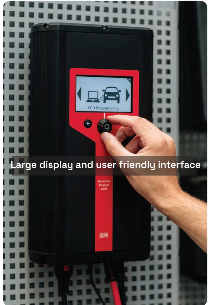
Large display and user friendly interface