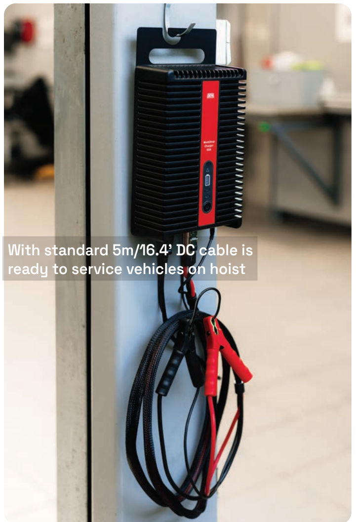
With standard 5m/16.4' DC cable is ready to service vehicles on hoist