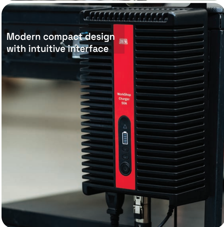
Modern compact design with intuitive interface