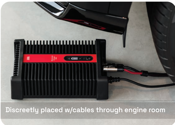
Discretely placed w/cables through engine room

Keep your vehicles fully functional, ready for demonstration in a clean looking showroom. The ShowroomCharger 40-50A is designed using modern switch-mode technology and galvanic isolation. It has a 95% efficiency with 7-steps charging cycle that optimizes the performance and durability of all types of batteries incl Li-ion. With the Powersupply function you get continuous power. The detachable DC cable can easily fit through the engine compartment and reach down to the floor, keeping the charger hidden. The charger has no fan which makes it completely silent. It's more durable preventing dust intrusion, and rubber feet and corners are available for further protection. You can upgrade the software at any time via the separate USB port.