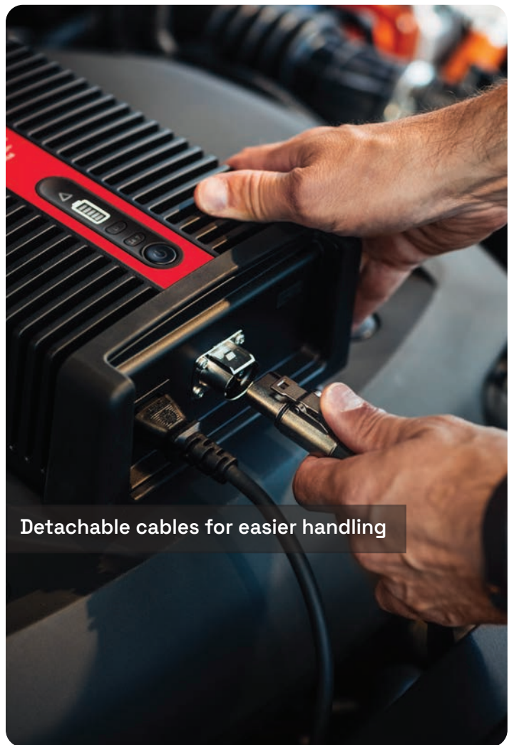
Detachable cables for easier handling

ShowroomCharger 40-50A 711300: With 5m/16.4' DC cable 713600: With 2.5m/8.2' DC cable