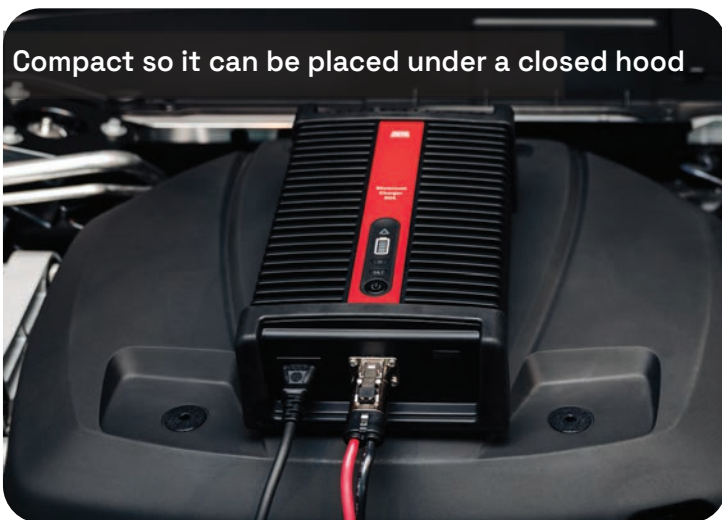
Compact so it can be placed under a closed hood